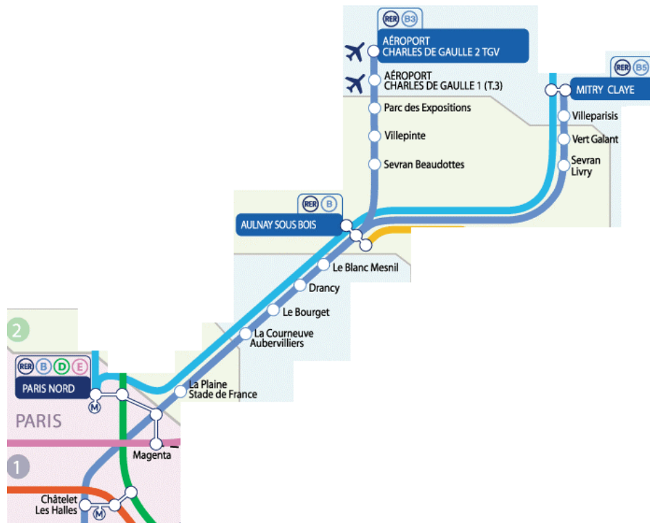
Figure 11 Part of the RER-B line (dark blue line) that is under consideration in this example

Several types of rail services are run on the common section of this line: some trains serve every station of the line, some trains are direct between Aulnay-sous-Bois and Gare du Nord, and some others serve only main intermediate stations. During peak hours the frequency is twenty trains per hour in the most crowded direction. The tracks of this part of the line are owned and maintained by RFF.